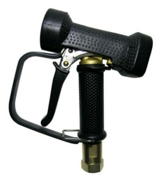
AKMBP01-BL-SWM-3/4 With ball bearing swivel in brass with 3/4"female and full bore.

All bold printed items are ex. Stock available